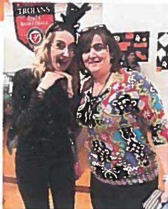
And whimsical fun