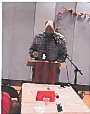
And thought- provoking prose.