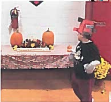
And decision-making (another cookie?)