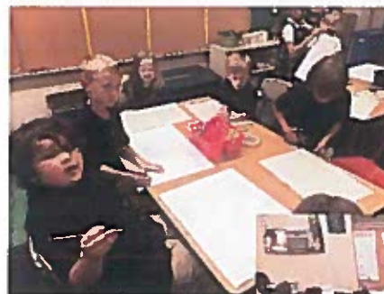
Kindergarten & 1 st Grade