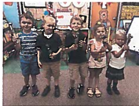
Our music program begins in PreK, with 3- & 4-year-olds learning the highs and lows of pitch and the teamwork of building scales and chords.