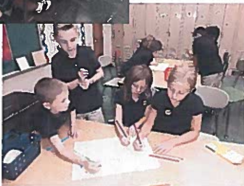
Circuits and Switches—Grade 4