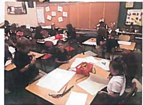
and teamwork process on a "Bucket-Filler" project.