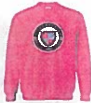
ITEM #18000 CREWNECK SWEATSHIRT RED, BLACK, WHITE OR SPORT GRAY YOUTH S-L: $18 ADULT S-XL: $18 XXL: $220 XXXL: $22