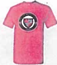
ITEM #5000 COTTON T-SHIRT RED, BLACK, WHITE, OR SPORT GRAY YOUTH S-XL: $11 ADULT S-XL: $11 XXL: $13 XXXL: $15