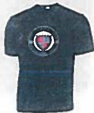
ITEM #ST350 PERFORMANCE T-SHIRT RED OR BLACK YOUTH S-XL: $14 ADULT S-XL: $14 XXL: $16 XXXL: $18