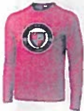
ITEM #ST350LS LONG SLEEVE PERFORMANCE T-SHIRT RED OR BLACK YOUTH S-XL: $17 ADULT S-XL: $17 XXL: $19 XXXL: $21