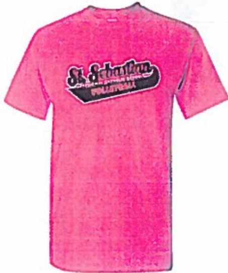
ITEM #5000 COTTON T-SHIRT RED OR BLACK YOUTH S-XL: $14 ADULT S-XL: $14 XXL: $16 XXXL: $18