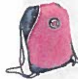
ITEM #BST600 CINCH BAG $12