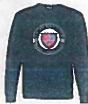
ITEM #5400 COTTON T-SHIRT RED, BLACK, WHITE, OR SPORT GRAY YOUTH S-XL: $15 ADULT S-XL: $15 XXL: $17 XXXL: $19