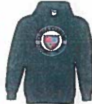
ITEM #18500 HOODED SWEATSHIRT RED, BLACK, WHITE, OR SPORT GRAY YOUTH S-XL: $23 ADULT S-XL: $23 XXL: $25 XXXL: $27