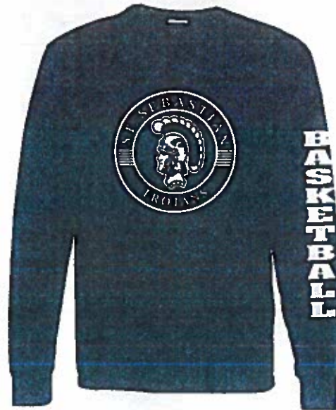
ITEM #5400 LONG SLEEVE COTTON T-SHIRT RED OR BLACK YOUTH S-XL: $19 ADULT S-XL: $19 XXL: $21 XXXL: $23